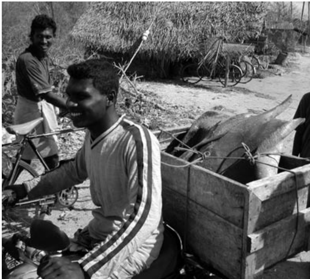
Transporting fish in Sri Lanka.