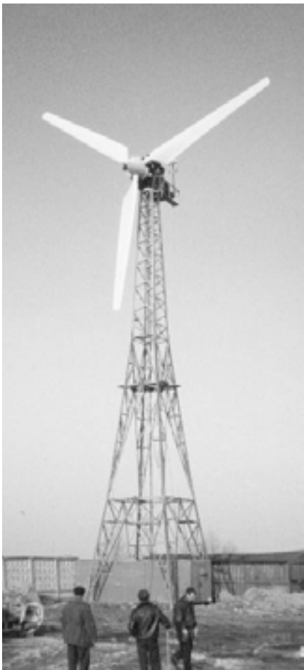
Ready for operation.