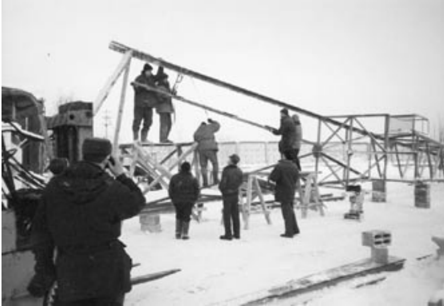
Assembling the tower.