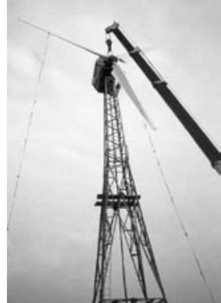
Installing the rotor.

Finally, after overcoming the customs barriers, we got Wind Matic together with new challenges. The workers who were going to install the wind turbine knew only that this