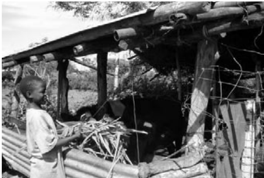
Creation of fodder banks on uncultivated land, Tete Province, Mozambique.

Tsangano was seen as a new heaven for fuelwood supplies. It is important to note that most of the deforestation occurred in what is now Ntengo-Wa-Mbalame Administrative Post. According to oral accounts from local elders, the current Administrative Post of Tsangano, which covers the villages of Chiyandame and Chitambe, was never forested. It is anticipated that project activities in Ntengo-Wa-Mbalame Administrative Post will focus on reforestation while those in Tsangano Administrative Post will focus on afforestation efforts.