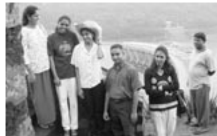
Young scientists from the Sri Lankan Climate Assessment, Prediction and Adaptation Group.

While projects should be awarded on a basis of merit of the proposal and the capability of team members, it should also be important to ensure that such projects meld into institutional plans. All the funding for projects by itself would not ensure the