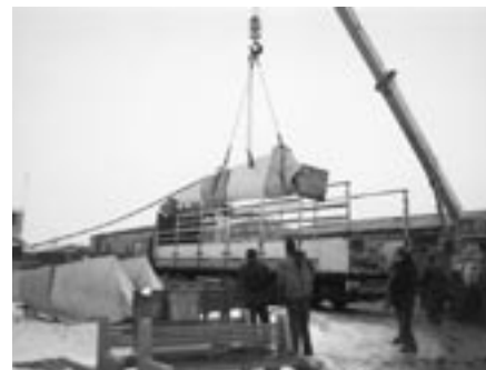
Arrival in St Petersburg.

Krasnoe, who produce different kinds of building materials, decided to install the