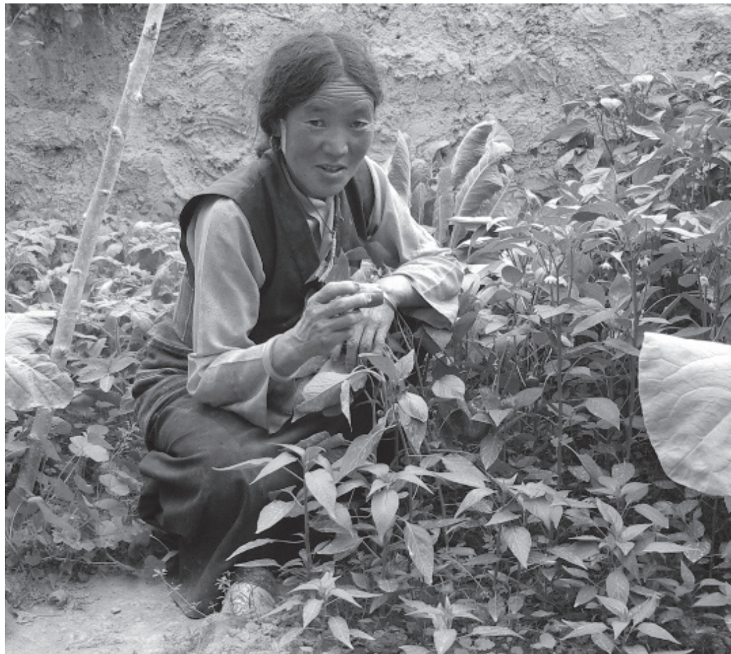
A farmer in her new vegetable garden in Mustang, Nepal

Cover photo: Leaf litter collection, Nepal