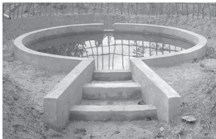
Run off rainwater harvesting tank