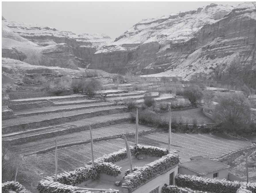
A traditional mud house in Tsale Village, Mustang District