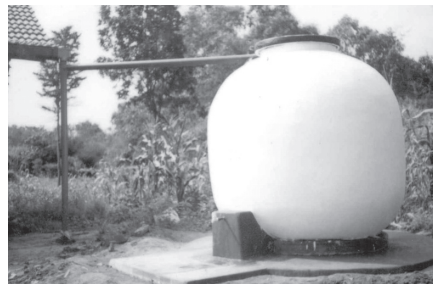
Aboveground rainwater harvesting tank

With improvements introduced by ITDG, Sri Lanka now promotes the construction of aboveground Ferro cement tanks with a capacity of 7500 litres. Rainwater harvesting is also used to support village livelihood