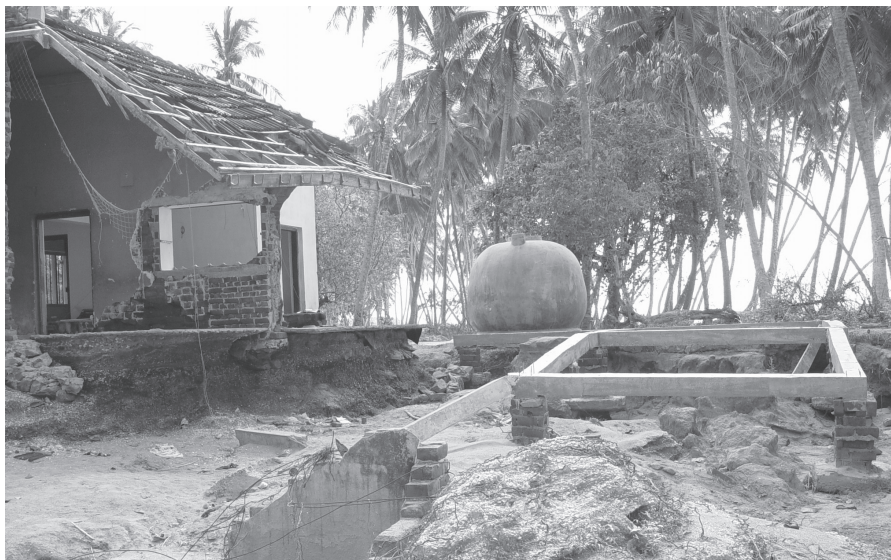
Tsunami damage in Sri Lanka