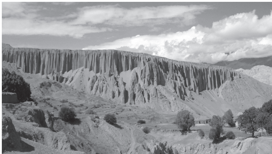
An erosion prone landscape in the rain shadow part of the Himalayas near Yara

Mountains are a source of fresh water for the hills and plains and are, therefore, considered 'water towers'. Erratic rainfall patterns means managing water is more challenging. Prolonged light rains help recharge groundwater but intense rainfall generates run off which leads to floods and landslides. Nepal also faces sedimentation problems. Widespread land degradation has reduced productivity. Hundreds of human lives and properties worth millions of rupees are lost every year to floods and landslides. As snowfall declines, springs and spring fed rivers show