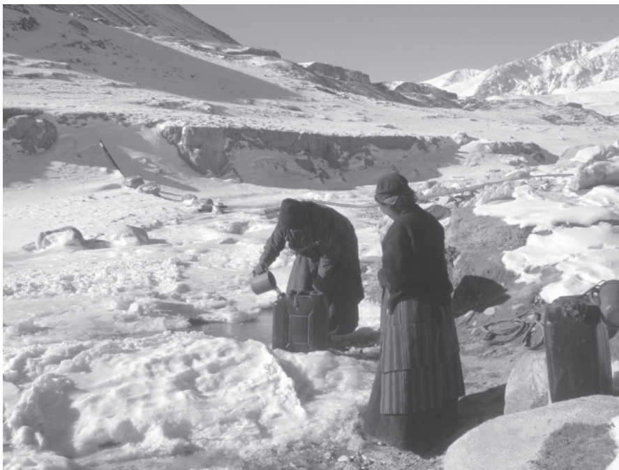
Local women from a high Himalayan village fetch potable water from a pond in winter