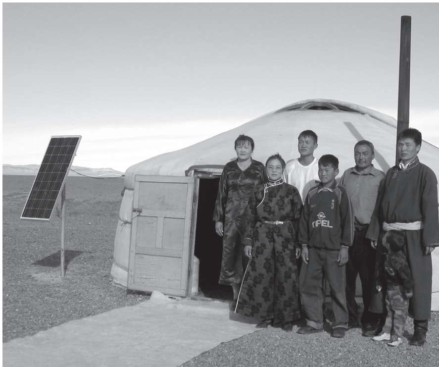
Renewable energy in the Gobi Desert, Mongolia