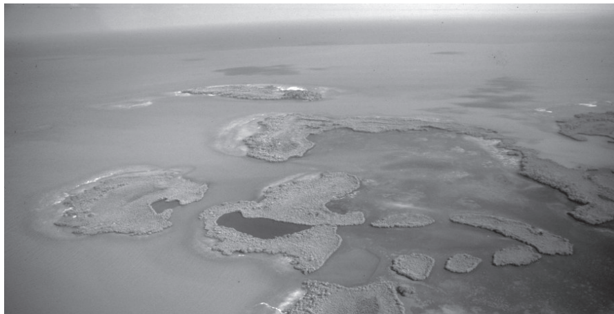
The Belize archipelago

Waste. The inclusion of liability issues regarding the transboundary movement of hazardous waste, World War II shipwrecks, and transportation of radioactive material was another highly contentious point in the negotiations. On the transboundary movement of hazardous waste, there was agreement for the cessation of such transport in SIDS regions as the “ultimate desired goal”.