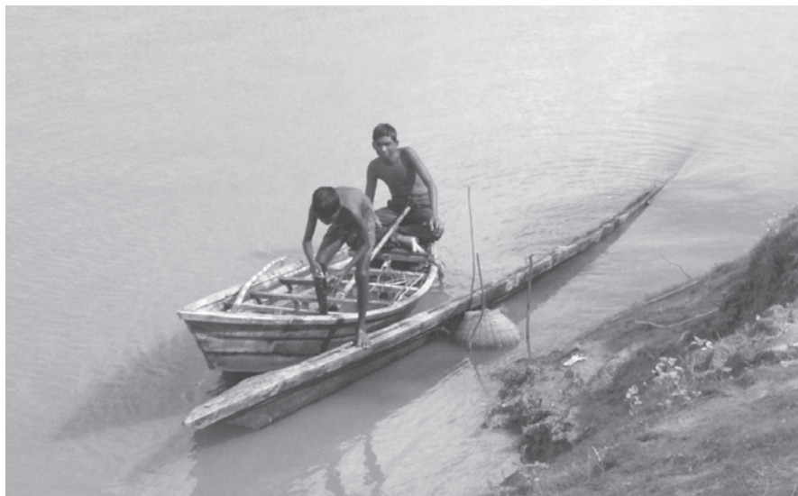
Fishermen in Bangladesh

Reducing vulnerability to climate change impacts on the ground can be achieved once the appropriate mechanisms, instruments and arrangements are in place to enable the