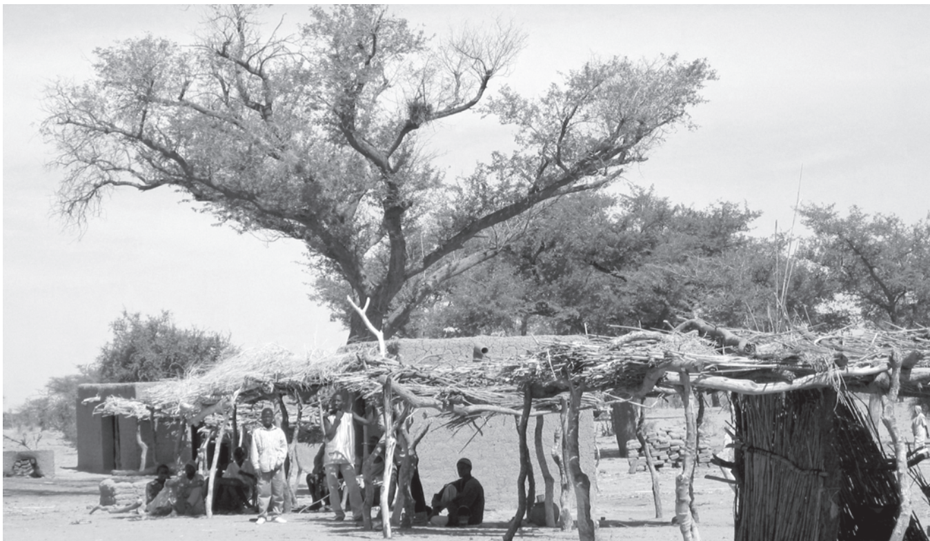
Rural community, Mali