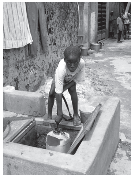
Boy collecting water, Sierra Leone

National governments are the interface between the international arena, where MEAs are negotiated, and local communities, where MEAs are converted into action. They therefore play a crucial role in facilitating MEA implementation. National gov-