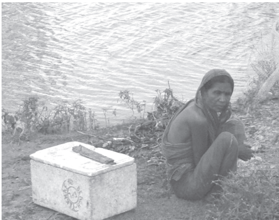
Bangladeshi woman with fishing nets

This article explains what priority actions are needed to build the resilience of the poorest and most vulnerable. It advocates a fundamental shift in our collective mindset to enable the most vulnerable to face current and future challenges using their own approaches. It explains the expectations that vulnerable people have from national and international actors and institutions to help them in their struggle for resilience. Priority actions are proposed to national and international policy-makers for consideration and action. Enabling the poor and vulnerable to access resources and services to address climate change related impacts and risks is their right. They do not want charity but rather what is owed to them, as enshrined in the United Nations Framework Convention on Climate Change (UNFCCC).