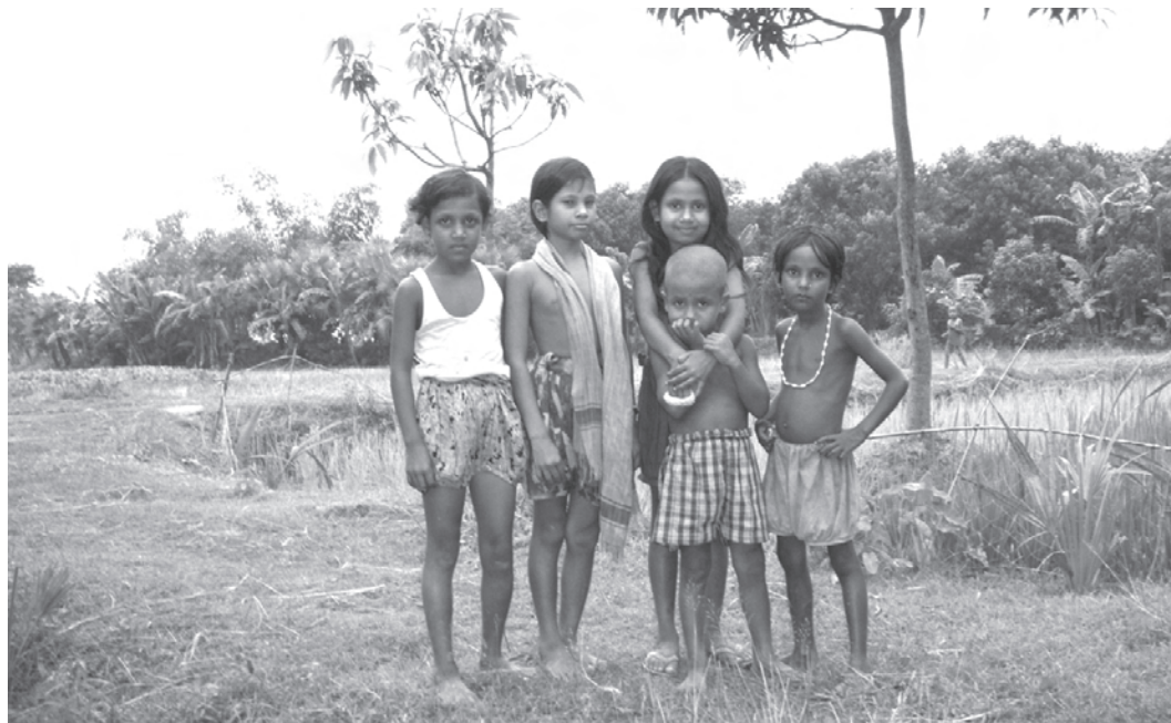
Children on the floodplain in Bangladesh