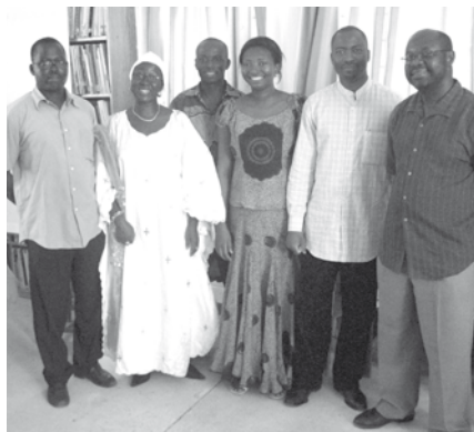
The Tiempo Afrique team

The vulnerability of the world's Least Developed Countries to climate change is widely acknowledged. Several of these countries are located in French-speaking West Africa. They