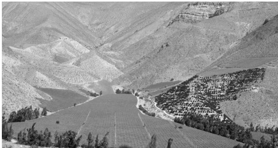
Vineyards and avocado plantations in Elqui Valley

Agricultural companies themselves are sensitive to water availability. The companies primarily rely on surface water from the Elqui River for irrigation. Surface water variations are managed through the adoption