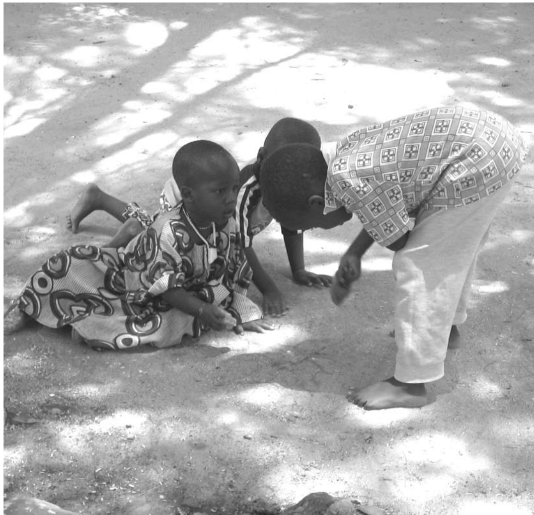
Children on Gorée Island, Senegal