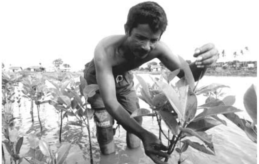
A farmer checks his mangrove trees at Lamnga beach in Aceh Besar, Indonesia. Mangroves protect coastal areas from erosion caused by severe weather

Seven respondents identified poor understanding of, or doubts about, climate change as an obstacle to getting it onto the strategic agenda. The British Red Cross said some staff were concerned that climate change was the latest aid fad. CARE noted that its response had been significantly delayed by “misinformation” on climate change in the United States. Three factors were seen as key to win-