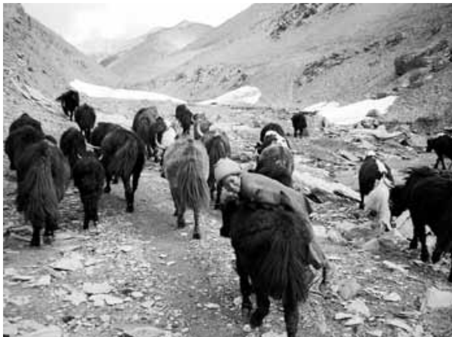
Yaks in the Himalayas