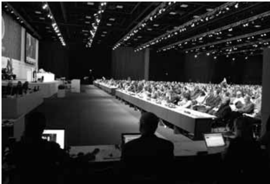
The Copenhagen negotiations