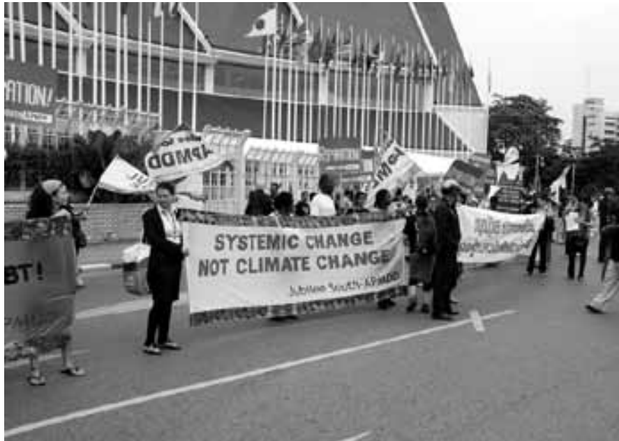
Protests - Copenhagen, COP 15

● Further information: The Tiempo Climate Cyberlibrary provides weekly coverage of news at www.tiempocyberclimate.org/news-watch/ . For detailed discussion of all climate negotiating meetings, visit Earth Negotiations Bulletin (ENB) at www.iisd.ca/process/climate_atm.htm . ENB has published daily reports and a summary of the deliberations at the Copenhagen climate summit at www.iisd.ca/climate/cop15/ .