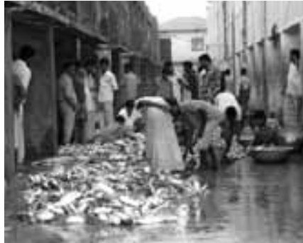
Bangladesh, fish market

There is a growing debate over whether those affected by climate change are a 'new' group in need of protection or if existing legal frameworks are sufficient. International, regional and national legal instruments, covenants and institutions exist to protect the rights of