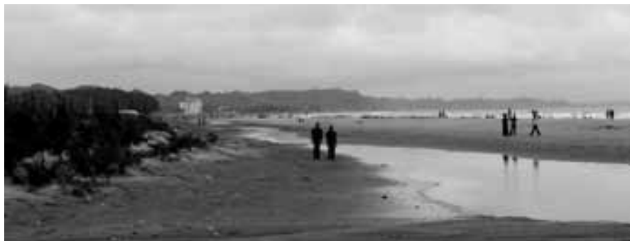
Cox's Bazar, Bangladesh

Climate change will increase existing internal displacement and cross border migration. In Bangladesh, some estimates suggest that one in every seven people will be displaced by climate change impacts by 2050.