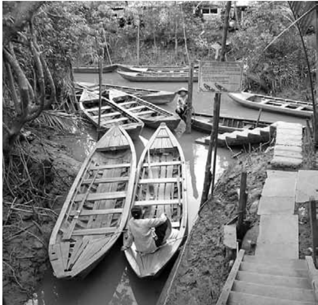
Vietnam, Mekong Delta