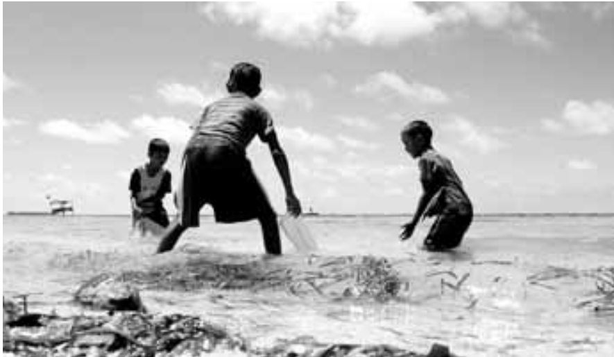
Children fishing in the Maldives