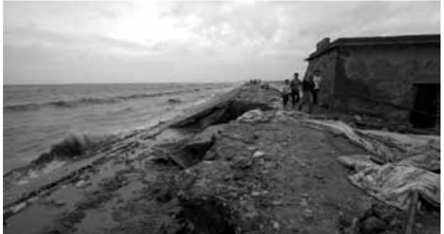
Storm damage to coastal defenses caused by Typhoon Damrey, Giao Thuy, Vietnam

While all four economic groups showed a similar level of knowledge and understanding acquired over the years with regard to their immediate livelihoods and related climate and socio-economic conditions, the environment-independent groups have made use of a considerably wider range of information sources, facilitated by the networks that they developed as they diversified their livelihoods.