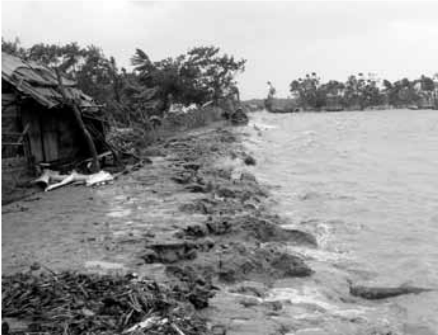
House of landless people on the Baleshwar River embankment