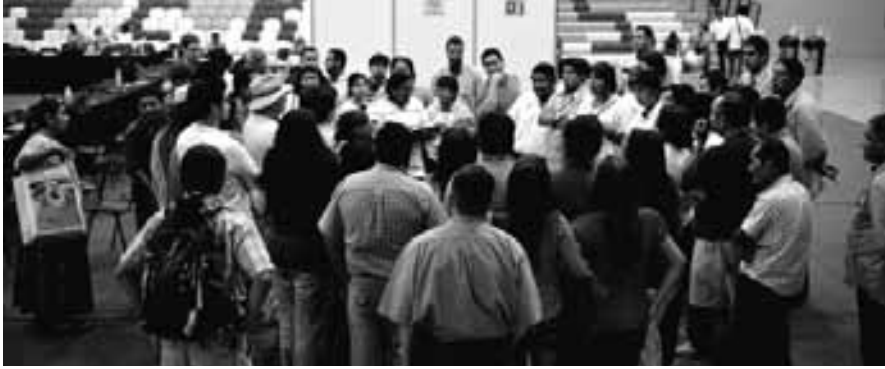
Cancún - indigenous peoples' caucus