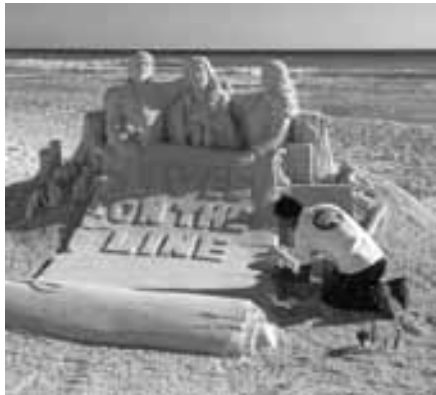
Cancún - Mexican farmers' sand sculpture