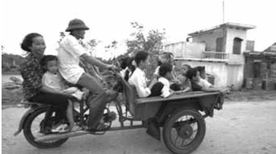
Fleeing Typhoon Damrey, Giao Thuy district, Vietnam