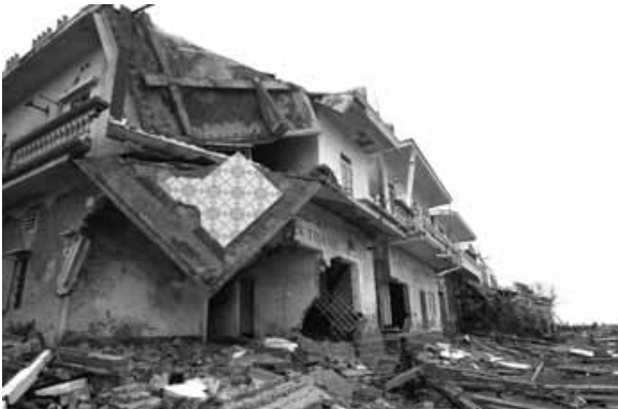
Storm damage caused by Typhoon Damrey, Giao Thuy, Vietnam