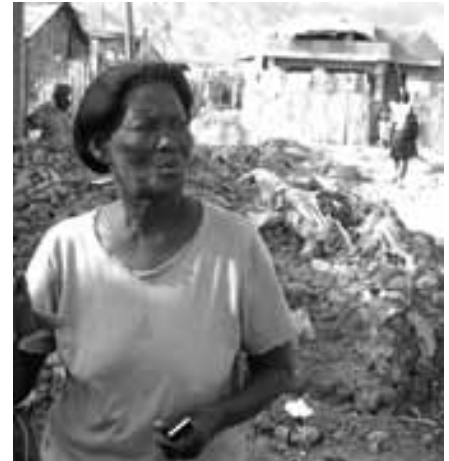
House demolished by mud slide during tropical storm, Gonaïves, Haiti, 2008

Strategies for climate change adaptation cannot be achieved without understanding