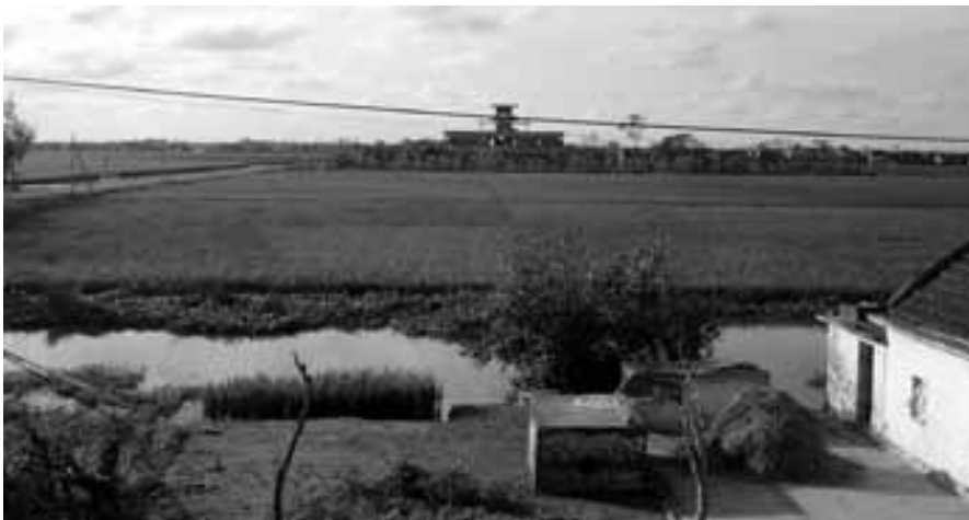
Rice field, Giao Thuy, Vietnam