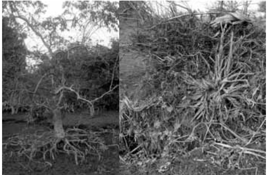
A tree with its main root intact survived the storm (left) while another fell down (right)

By way of explanation, the NGOs blamed their donors for allocating insufficient money to buy appropriate plants. But in my conversations with donors, they claimed a very good cooperation with their partners, especially in regard to funds. The government runs a monitoring device by empowering local government executives to authorize and approve any development project, but they remain silent as retired former bosses,