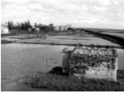
Shrimp farm, Giao Thuy, Vietnam