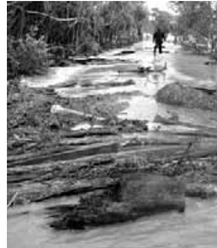
Flooding two miles from the Baleshwar River after the tidal surge created by cyclone Aila on May 25th 2009