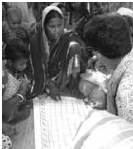
Discussing change in climate at a Pahari village

Perhaps because Bangladesh’s minority communities are so fragmented, it makes them particularly vulnerable to discrimination and negative socio-religious prejudice, for in very few places are they in a majority and they are widely misunderstood by the Muslim Bengali community. Being minorities that are often despised by many in the majority community, these smaller communities are already considerably disadvantaged by many social development criteria. For example, only half of language minority children are enrolled in school with around 60 per cent of those dropping-out later. Eighty-five per cent of indigenous ethnic minorities in north-west