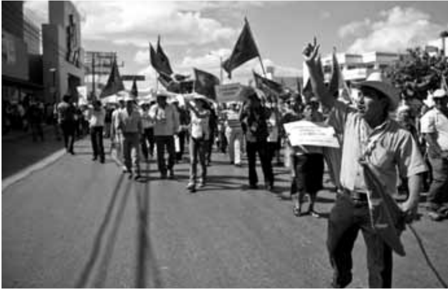
Thousands of demonstrators marched in Cancún to ask negotiators to achieve a fair deal against climate change